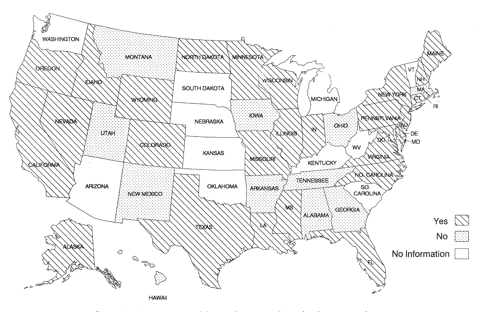
Fig. 5-2. Commission approved incentive rates for telephone services.