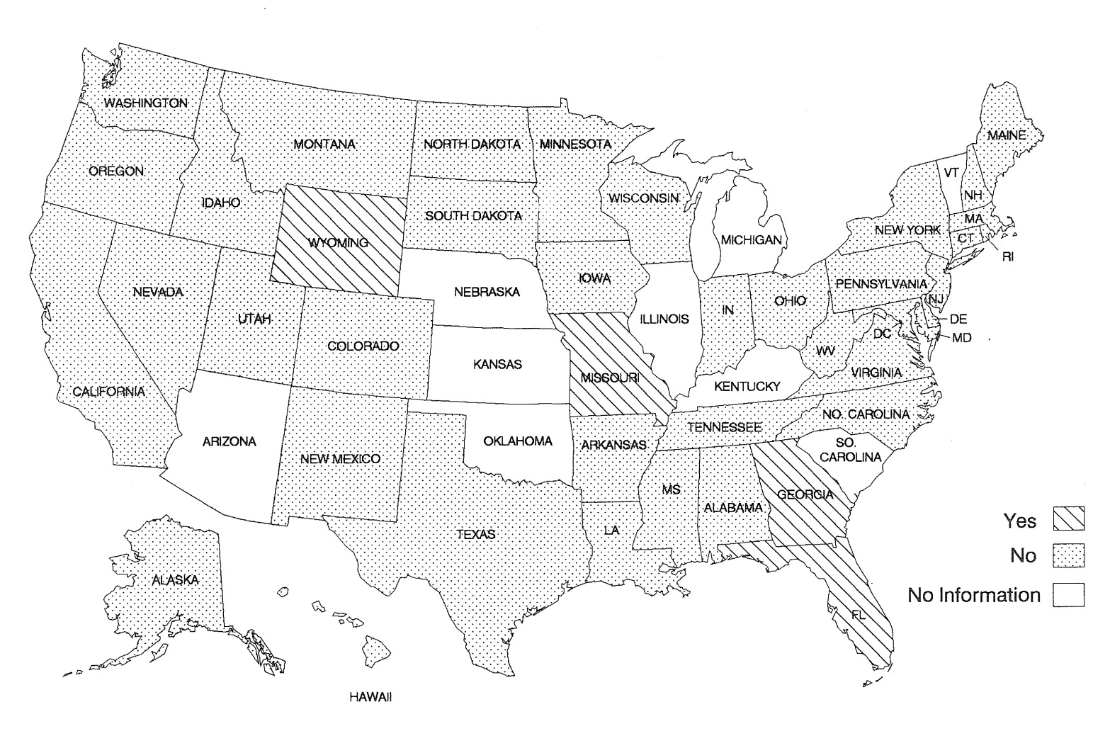
Fig. 5-1. Commission approved economic development rates for telephone services.