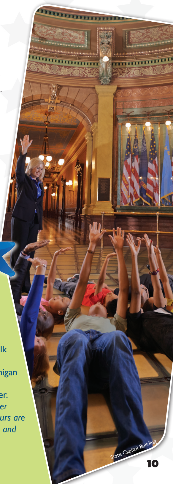
State Capitol Building

**Hint: Hit them up in the summer months when the school group tours are on hiatus. Check listings for hours and admission fees.