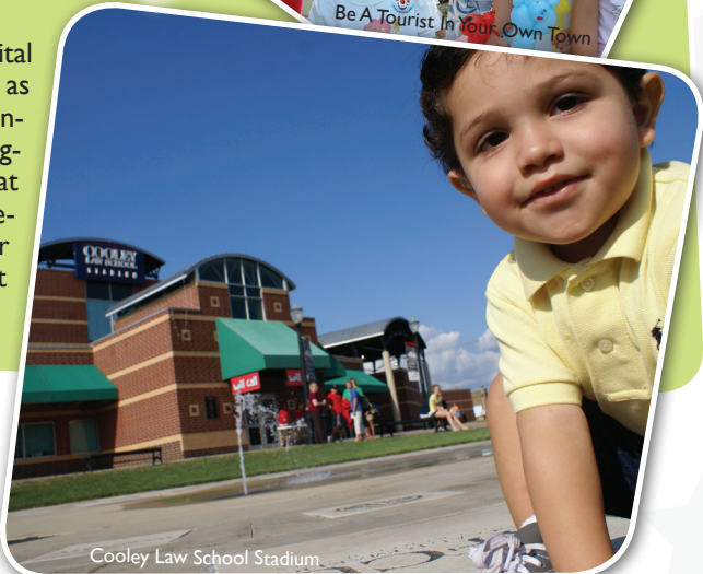
Cooley Law School Stadium