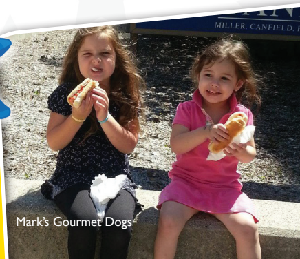
Mark's Gourmet Dogs