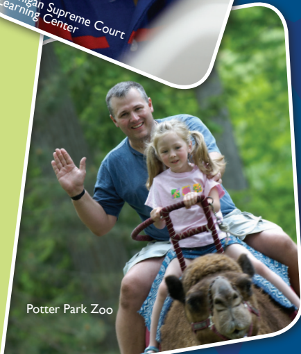
Potter Park Zoo

Home to the State Capitol, culture-rich museums and hands-on attractions. Come explore and discover Greater Lansing .