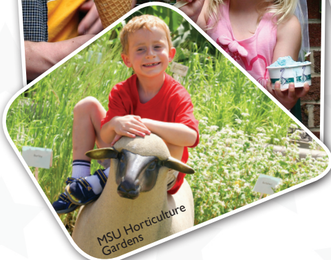
MSU Horticulture Gardens