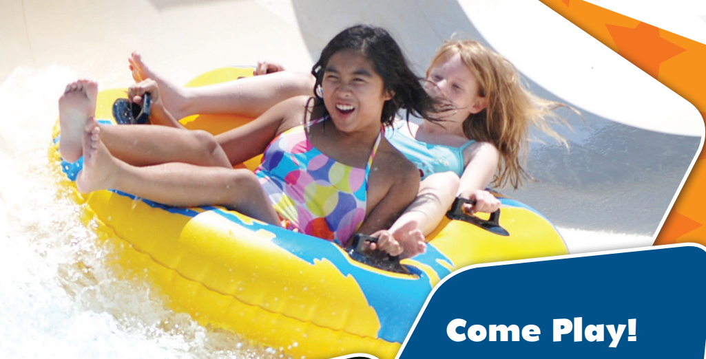
East Lansing Family Aquatic Center