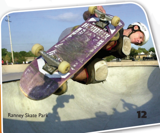
Ranney Skate Park