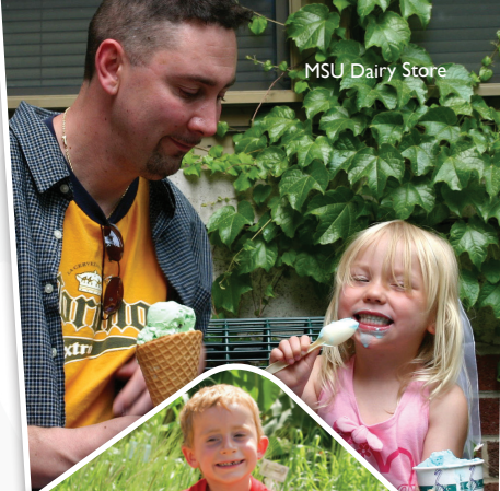
MSU Dairy Store

No visit to Michigan State University is complete without a family photo by The Spartan statue and a visit to the MSU Dairy Store for the freshest ice cream you'll taste. Try the chocolate cheese!