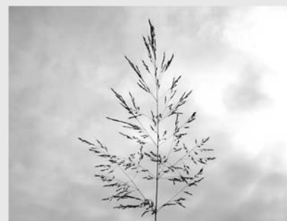
Open-branched, reddish panicle