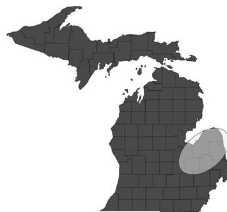
Common distribution of windgrass in Michigan