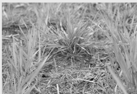
Tillering of windgrass in wheat