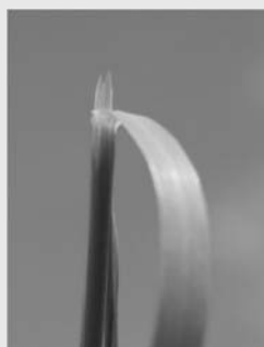
Jagged membranous ligule