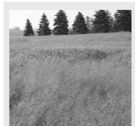
Windgrass in a Michigan wheat field

Common windgrass ( Apera spica-venti L.) is a winter annual grass species that has become more of a weed problem in winter wheat production. In the past the distribution of common windgrass in Michigan has been limited. However, over the last several years this weed has been reported in several counties. Management of this weed can be difficult because the emergence pattern and growth closely coincide with winter wheat, and the availability of selective herbicides is limited.